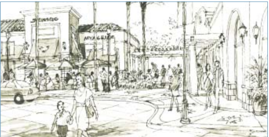
ARTIST'S RENDERING OF MERCED MARKETPLACE |

The Merced Marketplace is one of several large commercial developments that the Merced Irrigation District has been contracted to provide power to within the last year. |