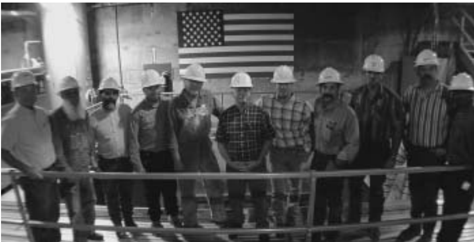
In tribute to the heroes of 9-11 the District's Hydroelectric crew at New Exchequer painted this American flag inside the powerhouse. It is so realistic some people think it is not a painting.