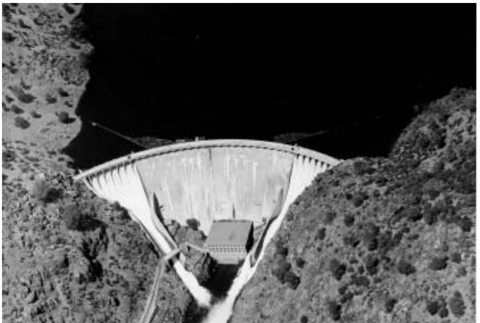
Old Exchequer Dam

Due to two consecutive dry years of snow-melt inflow combined with two years of robust water sales, Lake McClure is now down to 391,000 acre feet, or thirty-eight percent of capacity.