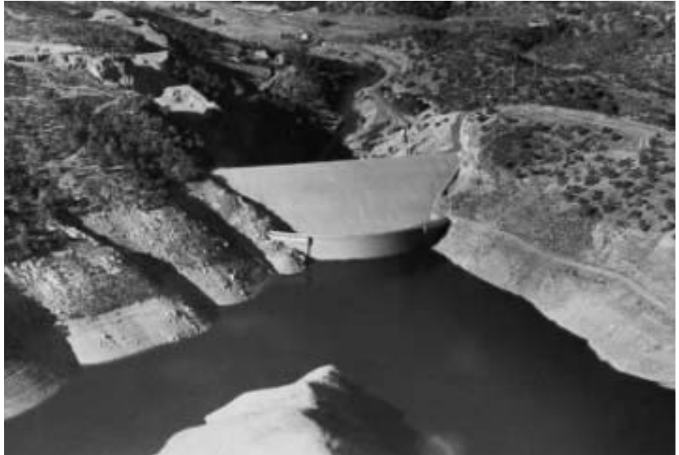
Both of the dams can be seen in the photo above. The Old Exchequer Dam is curved and shown in the forefront of New Exchequer Dam.

After eight years of slumber beneath hundreds of feet of water, the original Exchequer Dam is expected to again be visible by the end of October. Old Exchequer Dam, a concrete gravity arch dam completed in 1926, now acts as reinforcement to the upstream toe of New Exchequer Dam which was completed in 1967. The old dam impounded a maximum of 281,200 acre feet. With the completion of New Exchequer Dam, Merced Irrigation District growers now enjoy the security of Lake McClure which provides storage up to 1,024,600 acre feet. Due to two consecutive dry years of snow-melt inflow combined with two years of robust water sales, Lake McClure storage is now down to 391,000 acre feet, or 38% of capacity. This year's April through July runoff from the high Sierras to the lake totaled 426,700 acre feet, or 66% of the 98-year average. 2001 April through July inflow was only 357,900 acre feet or 56% of average. With the end of the 2002 irrigation season fast approaching, lake storage is expected to drop to 290,000 acre feet, a level not seen since November 1994. A steep drop in inflow to the lake in mid-July also caused the early termination of surplus surface water sales to lands outside the Merced Irrigation District boundaries.